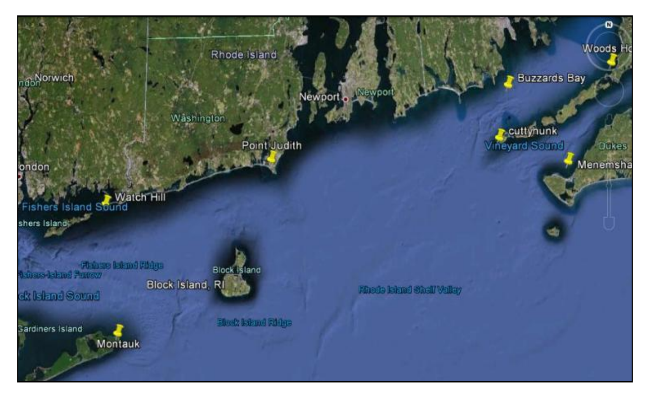
Google Maps views of the OSC racing area

A little bit about the geography of the racing area and then we'll get to Marionette's results in these Spring Series regattas over the past several years, measured not only by the OSC but by the S&S Association's Global Challenge Trophy Award committee.