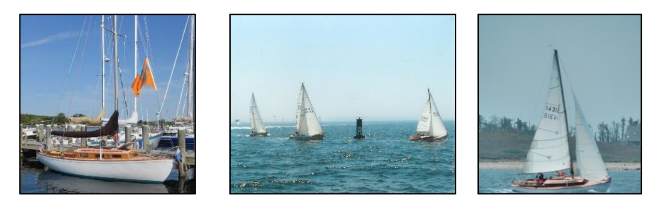
Left: Marionette at Payne's Dock, Great Salt Pond, Block Island, flying her battle flag; Center: A favorite position - leading bigger boats to the mark (note reefed main): Right: in close to shore, moving fast

Having covered the winning part we will close with the pretty part. The privilege of being the steady partner of a fast lady, is equaled only by being with her and having to deal with the endless pretty boat comments.